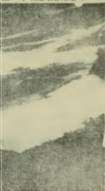
This photograph, showing the enemy blasting our ships on the morning of April 4, 1942, was sent from Kulbyshev to Moscow, whence it was radioed to New York. The four ships are described (left to right) as two United States cruisers, one of which is a fleet oiler, and a heavy cruiser that also has been hit. Beyond the island a column of water rises and a plume of smoke is seen (to right of column). According to the Japanese caption, American